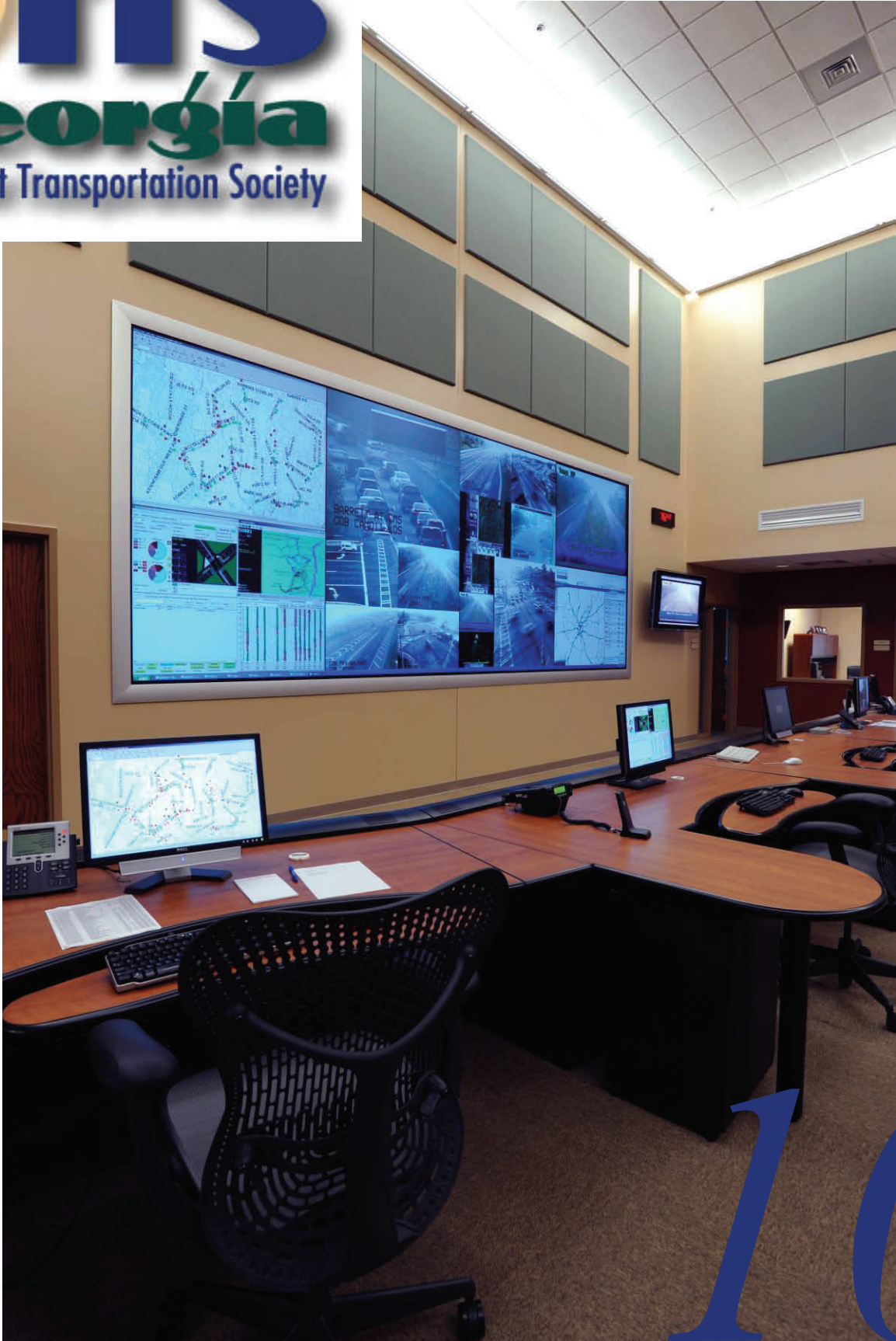
Cobb TMC—Winner Project of Significance